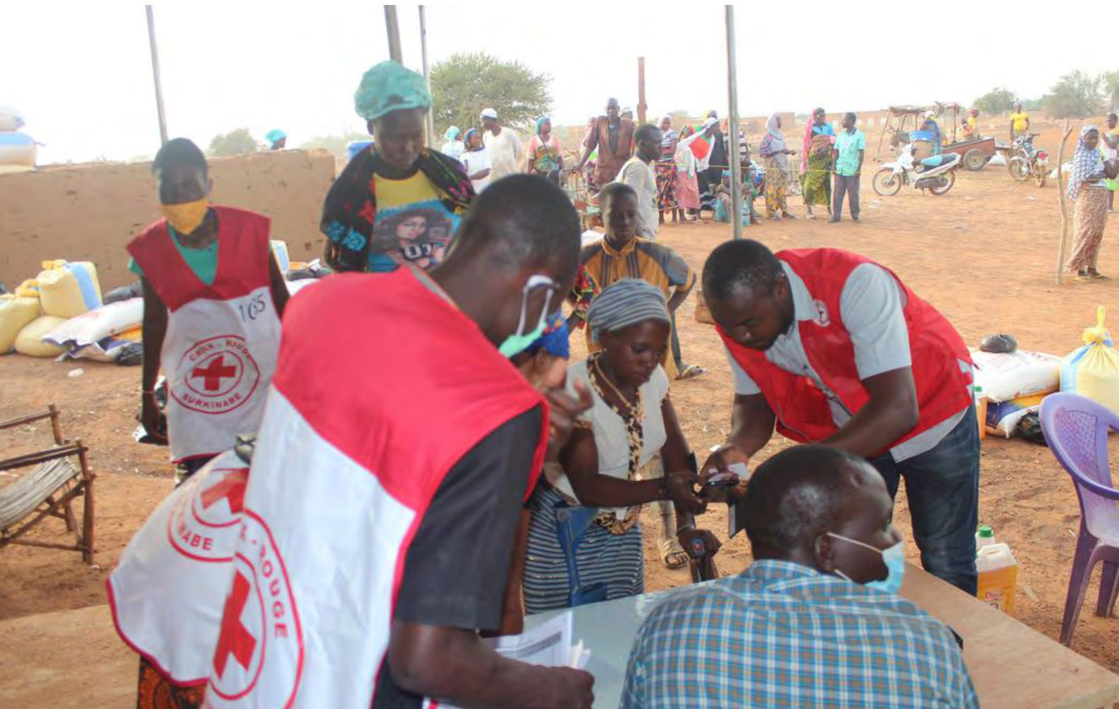
Volunteers of the Burkinabe Red Cross Society assisting internally displaced households through cash transfers

As part of wider Movement support, the International Committee of the Red Cross (ICRC) is committed to the Burkinabe Red Cross Society through support for crisis and disaster response, capacity building for staff, volunteers and committees and Restoring Family Links (RFL)