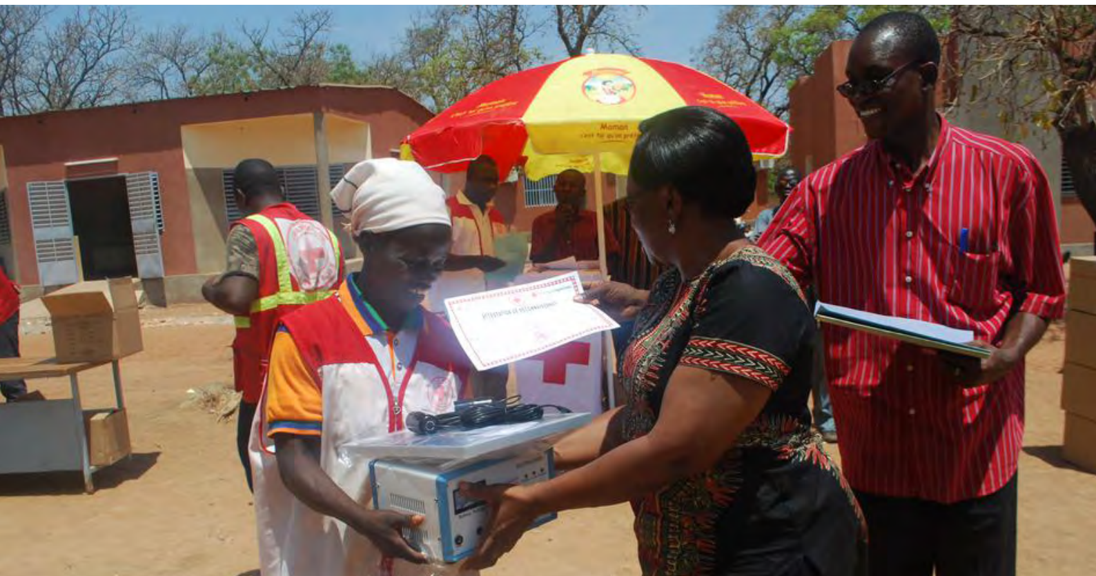
Burkinabe Red Cross Society organized a ceremony to publicly show its gratitude to all the provincial volunteers in front of their community and the highest local authorities

The Belgian Red Cross, Luxembourg Red Cross, Red Cross of Monaco and Spanish Red Cross support the National Society in various aspects of accountability and integrity.