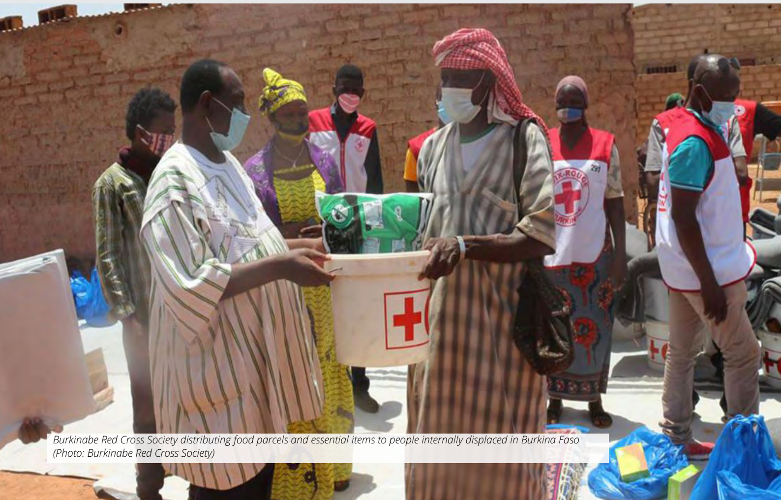
Burkinabe Red Cross Society distributing food parcels and essential items to people internally displaced in Burkina Faso